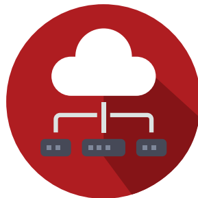
ISP Carrier Issue